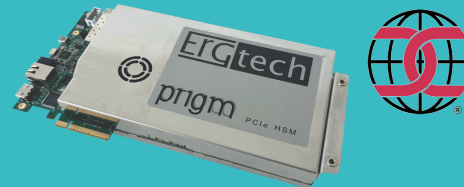
prigm PCI HSM Common Criteria EAL 4+

strengthened with symmetric/asymmetric cryptographic functions, hashing, true random number and crypto-key generation, and key management