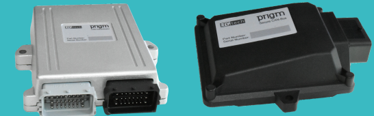
CANAT Secure CAN-bus Authentication Device

Customware Solutions strengthened with authorised on-board access control