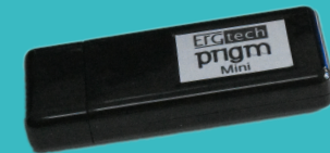
prigm Mini SecureStick (Authentication Token)

Authentication & Authorisation strengthened with FIDO-Compliant multifactor authentication for persons, "things" and vehicles